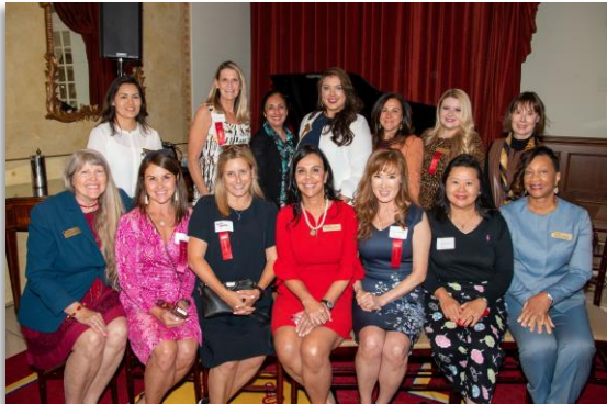
Our VPs of Membership with the New Town & Gown members