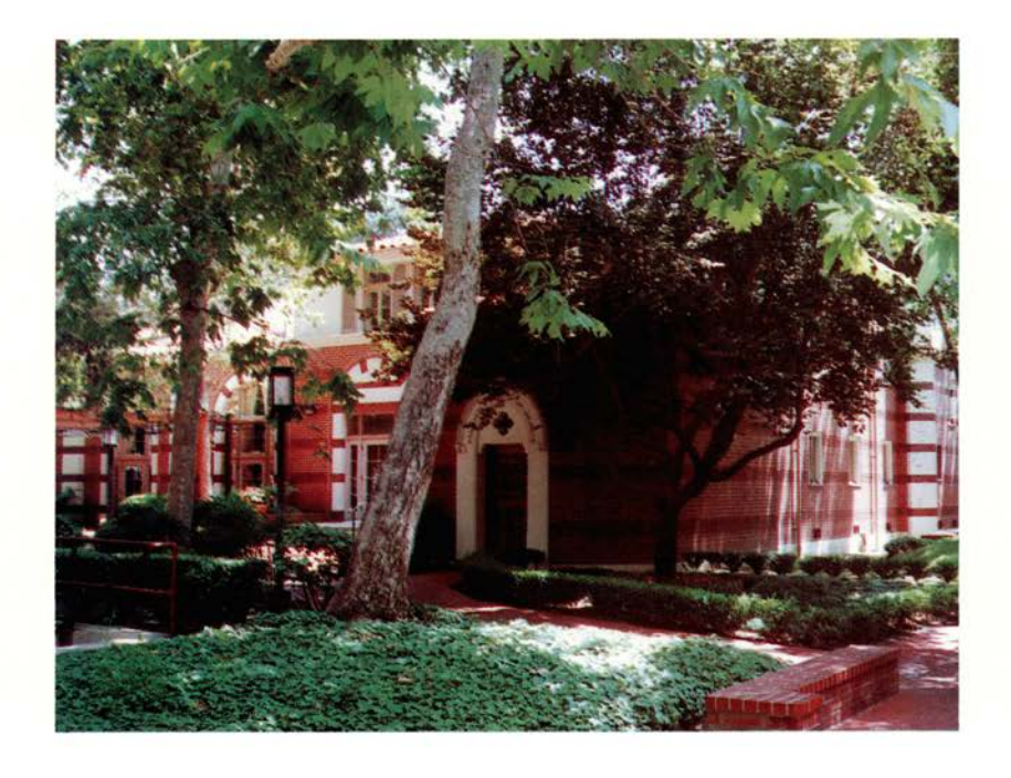
The Town and Gown Courtyard