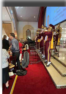
The Trojan Marching Band Entertaining Guests in the Town and Gown Ballroom

A recording of this program is available on the Town & Gown of USC website.